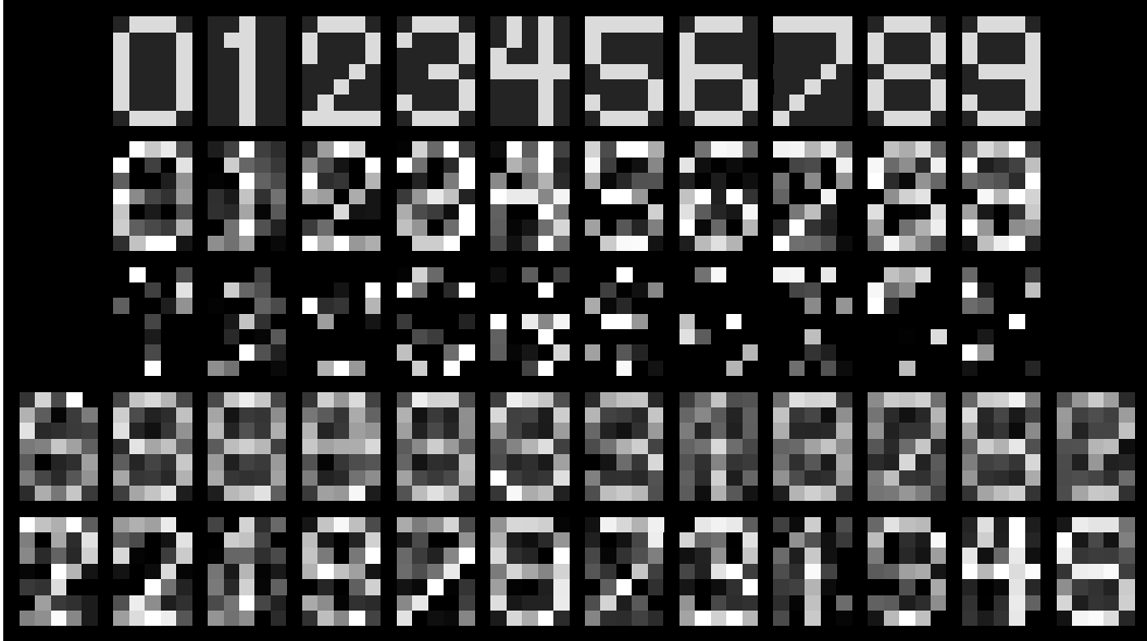
Figure 2: Learning digit patterns. First row: the ten 5 \times 7 templates used to generate the data set. Second row: templates with Gaussian noise added. Third row: templates with noise added and 50% missing pixels. The training set consisted of ten such noisy, incomplete samples of each digit. Fourth row: means of the twelve Gaussians at asymptote ( \sim 30 passes through the data set of 100 patterns) using the mean imputation heuristic. Fifth row: means of the twelve Gaussians at asymptote ( \sim 60 passes, same incomplete data set) using the EM algorithm. Gaussians constrained to diagonal covariance matrices.

In this example (Fig. 2), the Gaussian mixture algorithm was used on a training set of 100 35-dimensional noisy greyscale digits with 50% of the pixels missing. The EM algorithm approximated the cluster means from this highly deficient data set quite well. We compared EM to mean imputation, a common heuristic where the missing values are replaced with their unconditional means. The results showed that EM outperformed mean imputation when measured both by the distance between the Gaussian means and the templates (see Fig. 2), and by the likelihoods (log likelihoods \pm 1 s.e.: EM -4633 \pm 328 ; mean imputation -10062 \pm 1263 ; n = 5 ).