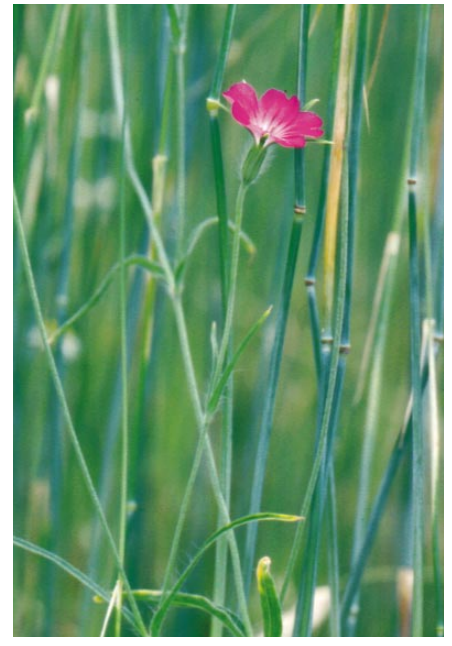
Figure 1 The corncockle. This weed (or flower, according to your point of view) is now rare in Britain but is still relatively common in southern and eastern Europe.

To test this possibility, Keller et al. <sup>1</sup> studied three weed species, the common poppy ( Papaver rhoeas ), corncockle ( Agrostemma githago ; Fig. 1) and white campion ( Silene alba ). Their seeds are available commercially from several countries, including Switzerland, Germany, Britain, Hungary and the United States, and all are derived from local wild populations. The authors conducted a range of crossing experiments (always using Swiss material as mother plants) and measured such features as biomass yield, sur-